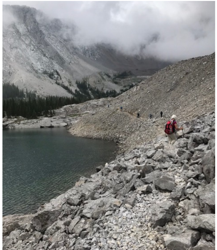
Picklejar Lakes, July 4, 2021

Thanks to everyone for making the 2021 season a success despite the extreme heat, smoke from the wildfires & the May shut down due to Covid restrictions.