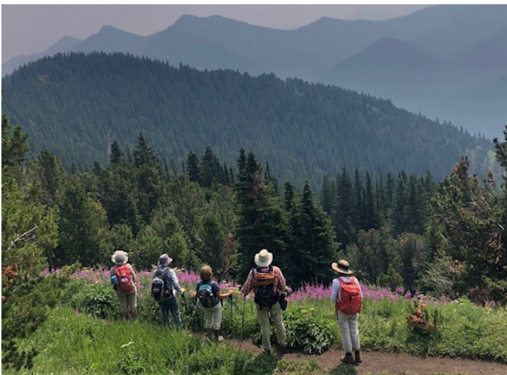
Mount Lipsett, July 25, 2021

Thanks to everyone for making the 2021 season a success despite the extreme heat, smoke from the wildfires & the May shut down due to Covid restrictions.